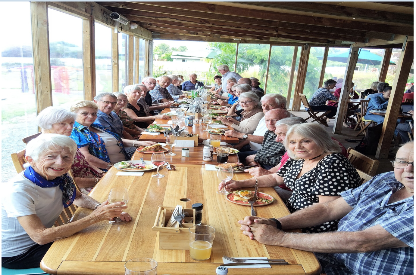
We had a good turnout for our Christmas luncheon at the Craftsman Café.