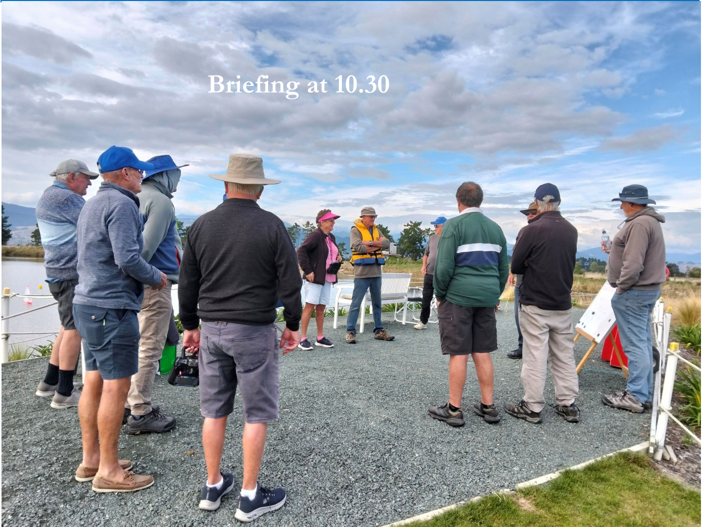
Briefing at 10.30

Lunch time on day one was early as the breeze didn't kick in until the afternoon. A lot of friendly banter and comradeship made it all very enjoyable.