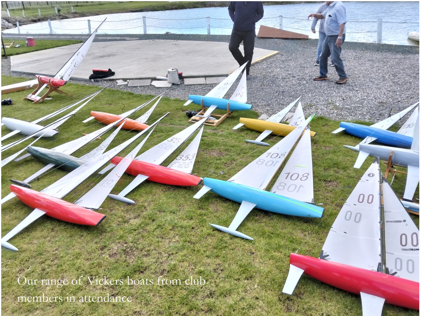
Our range of Vickers boats from club members in attendance