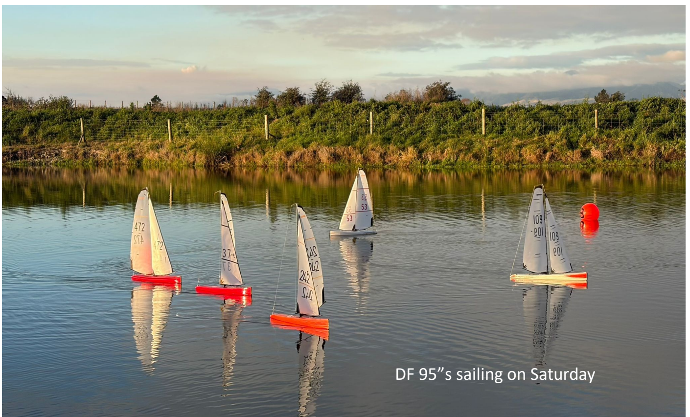
DF 95" sailing on Saturday