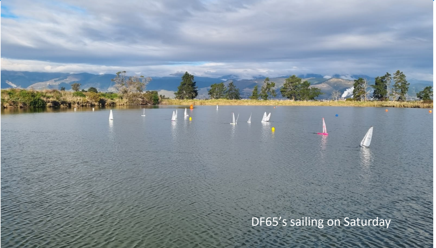
DF65's sailing on Saturday

-NZRYA are in discussion with Yachting NZ around the potential to formalise the use of Radio Sailing events as part of the YNZ programme of race official training (Race Officers, Line officials, Judges, Umpires) . Both Radio Sailing and full size events struggle to keep a sustainable pool of such officials available, and having exposure to RC events for all trainees can only be beneficial to both the trainee (gets to experience and manage 20 races across a day compared with 2 or 3 on full size courses), and radio sailing in terms of more officials with suitable experience-even if "in training" (Text is courtesy of Pegasus club)